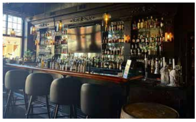
A Much Expanded Food Menu and Craft Cocktails hand made behind the restored bar